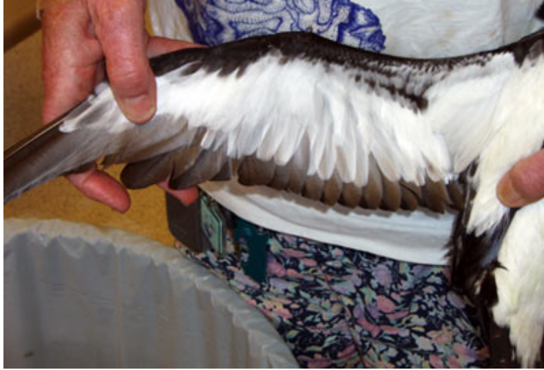
Figure 2. Underwing of Newell's Shearwater.

its undertail coverts: white basally, black distally. He measured it, pulled three undertail coverts for preservation of some physical evidence, Dana McLaughlin took several photographs, and Faulkner returned the bird to her home care center.