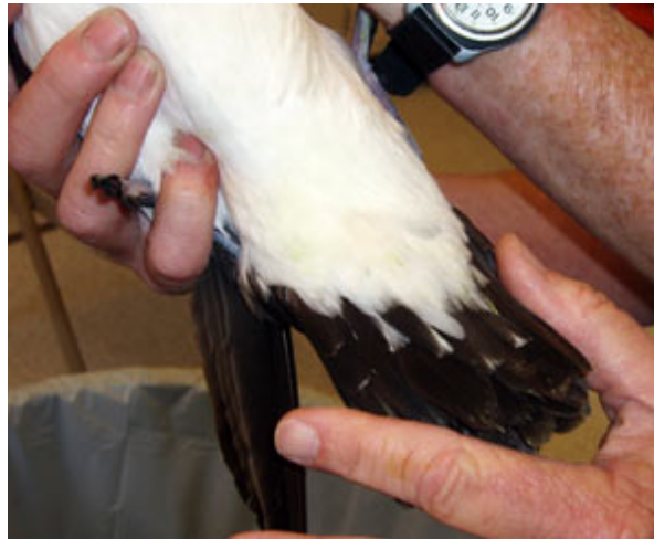
Figure 4. Undertail coverts of Newell's Shearwater.

Although a specimen to document such a remarkable occurrence would be ideal, we believe the photographs and measurements support the identification adequately. Newell's Shearwater is formally listed as a threatened species by the U.S. Fish and Wildlife Service . Threats to it include predation by feral cats and introduced Barn Owls ( Tyto alba ), collision with wires and other man-made hazards, and disorientation by artificial lighting at night (Ainley et al. 1997). From 1993 to 2001, Day et al (2003) reported a decline of 61.5% on the basis of radar detections and of 72% on the basis of numbers of fledglings picked up after mishaps. Typhoon Iniki in 1992 may have killed many nestlings (Day et al. 2003).