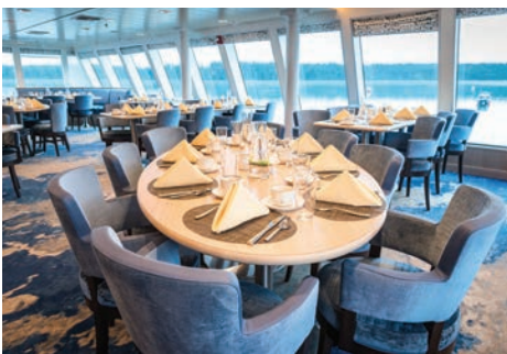
The casual dining room with its expansive windows.

Served in single seatings with unassigned tables for an informal atmosphere. Cuisine is fresh, sustainable, accented with regional flair and served plated.