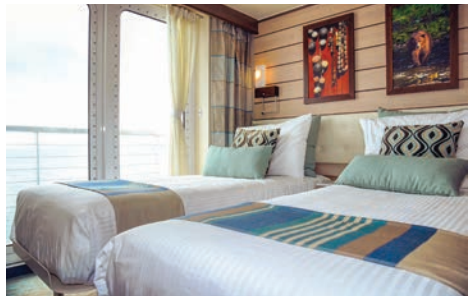
Category 4 cabin with single beds (which can be converted to a queen) and a private step-out balcony.