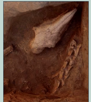
At Krasnyi Yar, the site of an ancient village, scientists found these horse bones carefully buried—a clue to domestication.