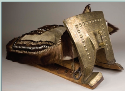
This 100-year-old saddle was likely used by a wealthy rider in Russia's Sakha Republic.