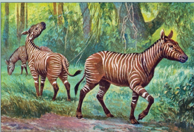
Three-toed, leaf-eating horses such as Hypohippus persisted in the forests of North America until about 9 million years ago.