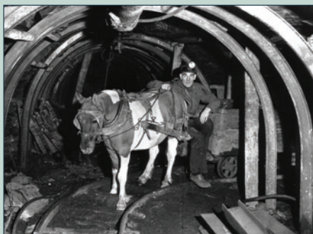
People bred small Shetland ponies to work in coal mine shafts.