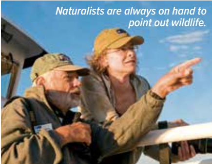
Naturalists are always on hand to point out wildlife.

Discover Baja with a veteran expedition leader and a team of naturalists well versed in the region's flora and fauna. An undersea specialist/videographer shoots video for you to enjoy in the comfort of the ship's lounge, maximizing your understanding of Baja's incredible marine environment. A certified photo instructor assists you in capturing