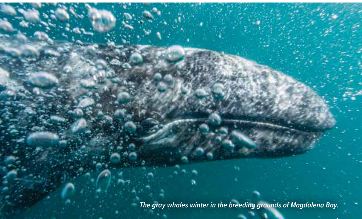
The gray whales winter in the breeding grounds of Magdalena Bay.

8 DAYS/7 NIGHTS—ABOARD NATIONAL GEOGRAPHIC VENTURE