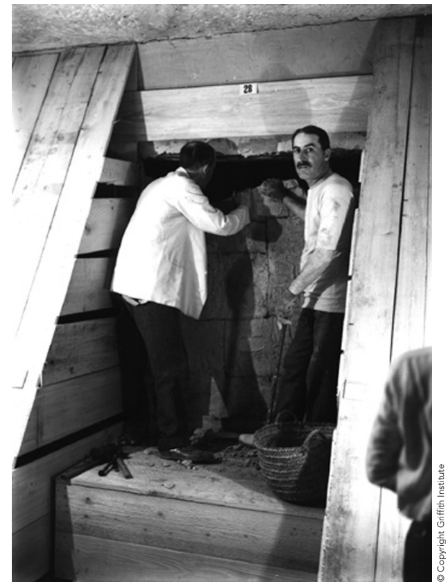
Howard Carter during work on the burial chamber

had discovered the tomb of Tutankhamun. The first article about the discovery of the tomb appeared on November 30 in the English newspaper, The Times . The discovery was celebrated as a sensation in the media around the whole world. Howard Carter immediately put a team of experts together. The chambers were thoroughly and scientifically cataloged and cleared out. That took 10 years. The exhibition, The Discovery of King Tut , shows the tomb chambers just as Howard Carter and Lord Carnarvon found them on their discovery.